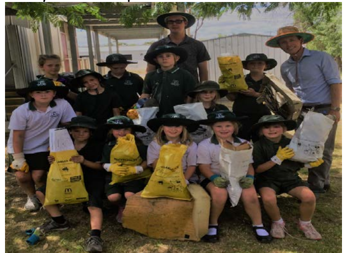
After cleaning up, lots of rubbish great job!