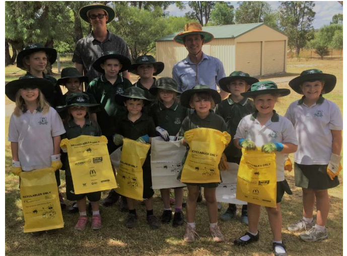
Ready to clean up